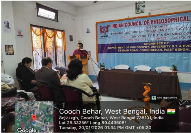
Cooch Behar, West Bengal, India 8cjb+xgh, Cooch Behar, West Bengal 736101, India Lat 26.33256° Long 89.443508° Tuesday, 20/01/2026 01:34 PM GMT +05:30