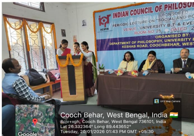
Cooch Behar, West Bengal, India 8cjb+xgh, Cooch Behar, West Bengal 736101, India Lat 26.332364° Long 89.443652° Tuesday, 20/01/2026 01:43 PM GMT +05:30