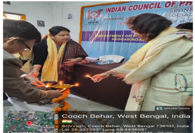
Cooch Behar, West Bengal, India 8cjb+xgh, Cooch Behar, West Bengal 736101, India Lat 26.332393° Long 89.443608° Tuesday, 20/01/2026 01:39 PM GMT +05:30