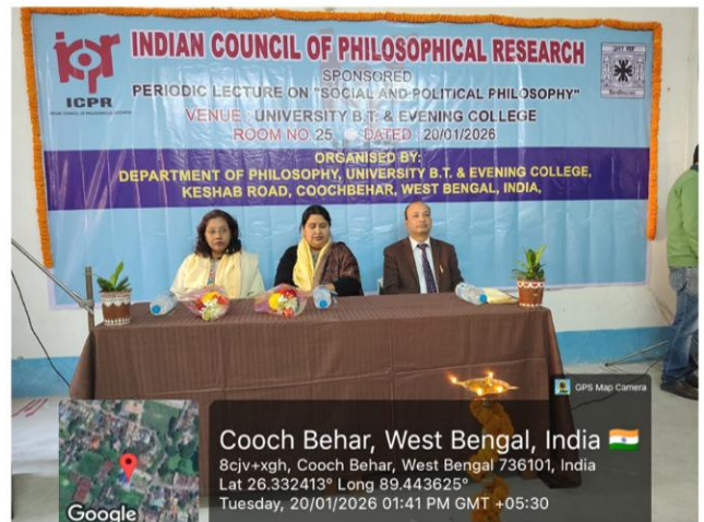
Cooch Behar, West Bengal, India 8cjb+xgh, Cooch Behar, West Bengal 736101, India Lat 26.332413° Long 89.443625° Tuesday, 20/01/2026 01:41 PM GMT +05:30